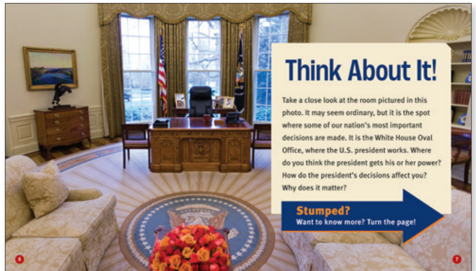
Sample spread from The Presidency